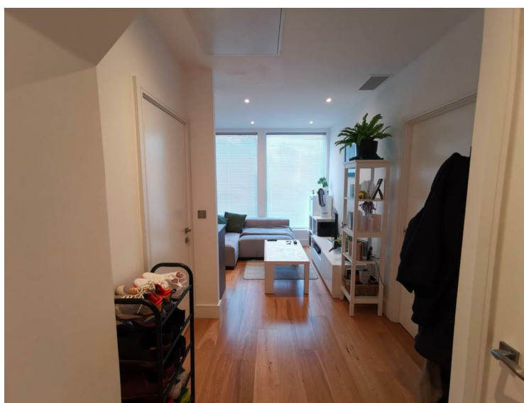
Laminate flooring, entry phone system, storage cupboard housing wall mounted boiler and fuse box.