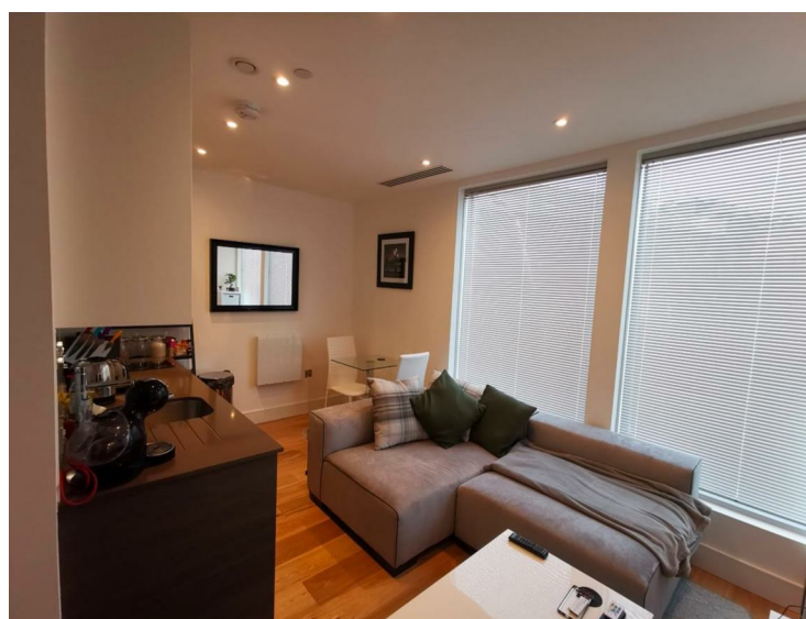
Electric heater, power point, double glazed window, spotlights, air vent.