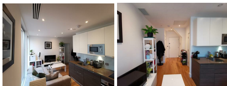
Single bowl sink unit with mixer tap and cupboard below, further wall and floor units, built-in hob and oven, integrated microwave and dishwasher.