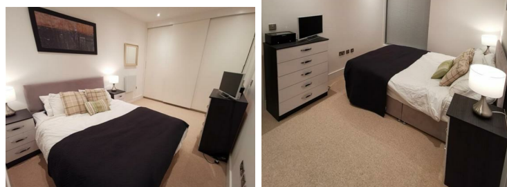
Double glazed window, electric heater, built-in wardrobes with sliding doors.