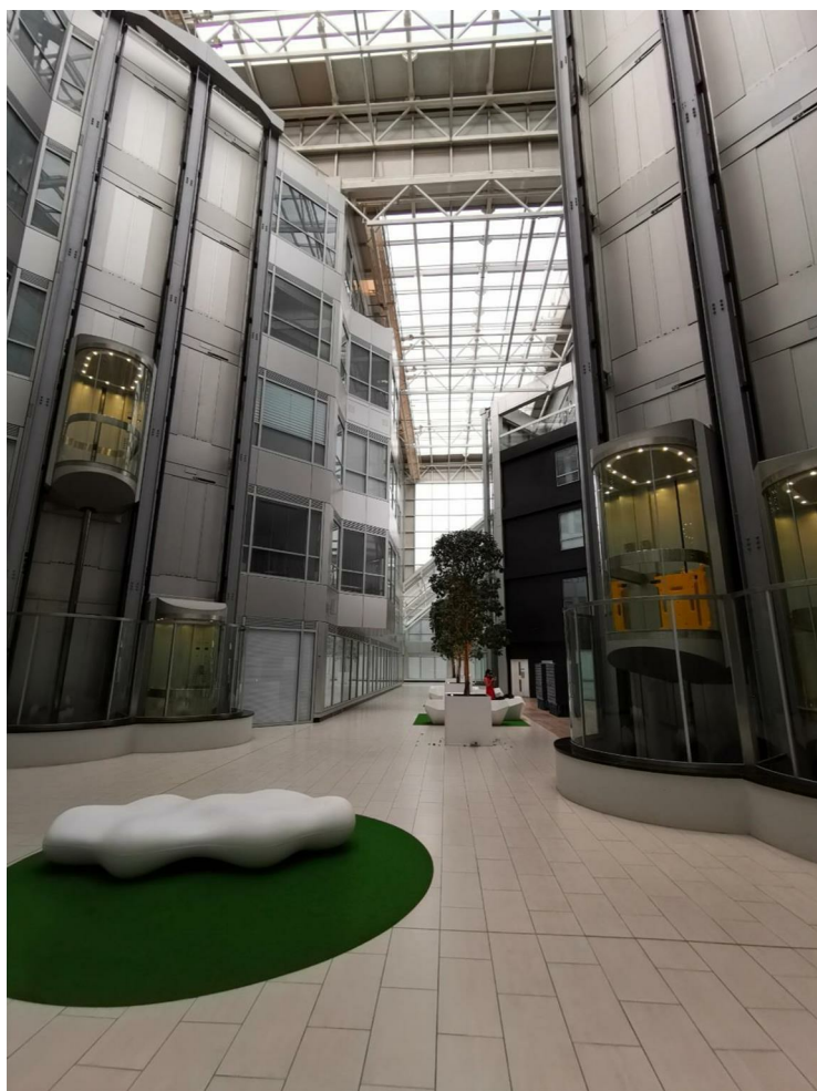
Entry phone system, lifts and stairs to first floor.